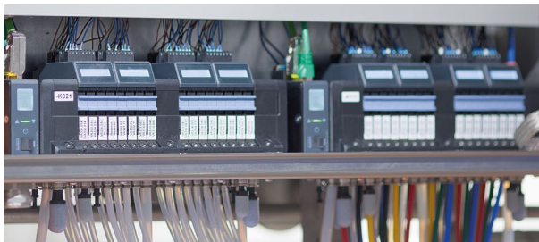
Valve island type 8652 AirLINE with up to 48 valve functions each.

All important information about the process, such as current switching states of pilot and process valves or the detection of cable breaks, is available for the user directly on site on the valve islands' display. This data is also forwarded to the system control via PROFINET. The valve islands are equipped with all common pneumatic process safety features as a standard. For example, check valves in the ventilation duct prevent valves being unintentionally enabled by pressure peaks in the ventilation duct. This ensures a high level of process reliability. Thanks to the hot-swap function, valves can be changed while the system is running under pressure and when voltage is applied. This means that there is no production downtime here either.